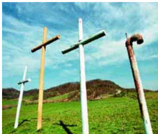
The Original 3 Coffindaffer Crosses. Flatwoods exit of Interstate 79, WV

When he returns, Jesus will find Faith on earth.